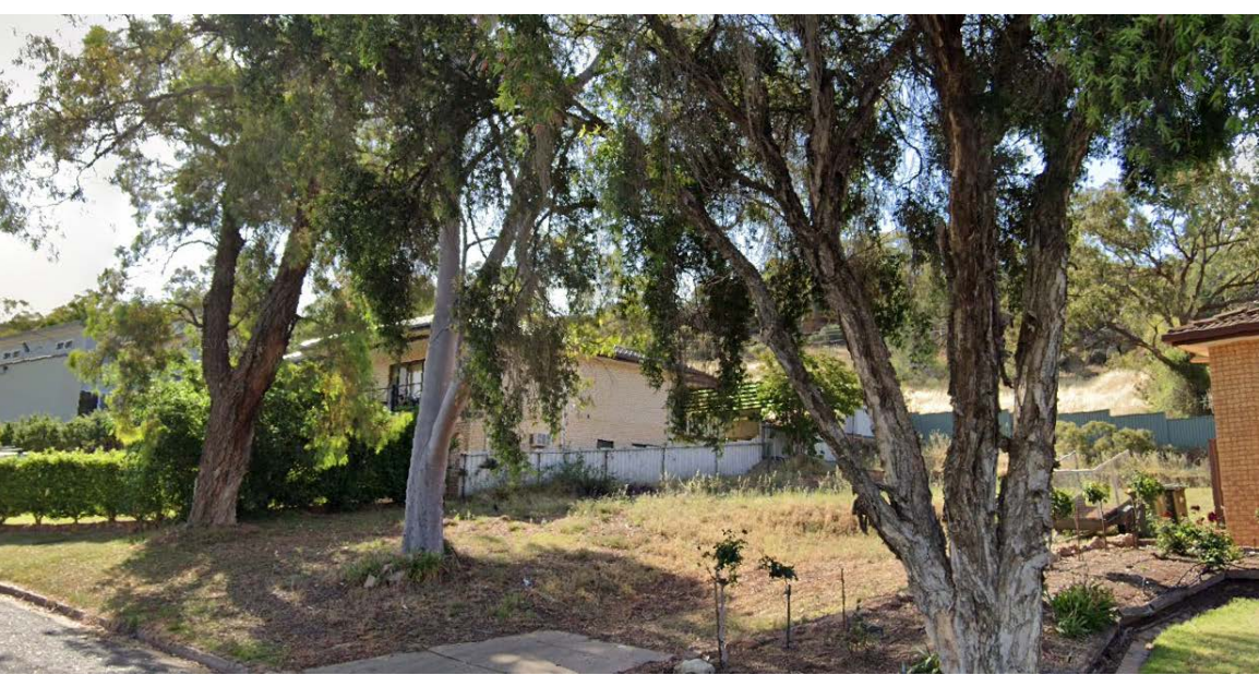
Street View of 46 Lawford Crescent Looking North West