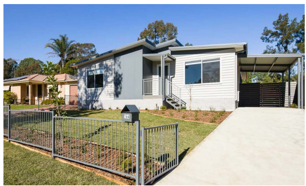
AHO property with cement clad and brick dwarf wall around footings.

The AHO would also be open to constructing a brick dwarf wall (in lieu of cladding) around the footings underneath each dwelling, to compliment neighbouring properties and provide consistency within the locality as seen on a previous AHO project: